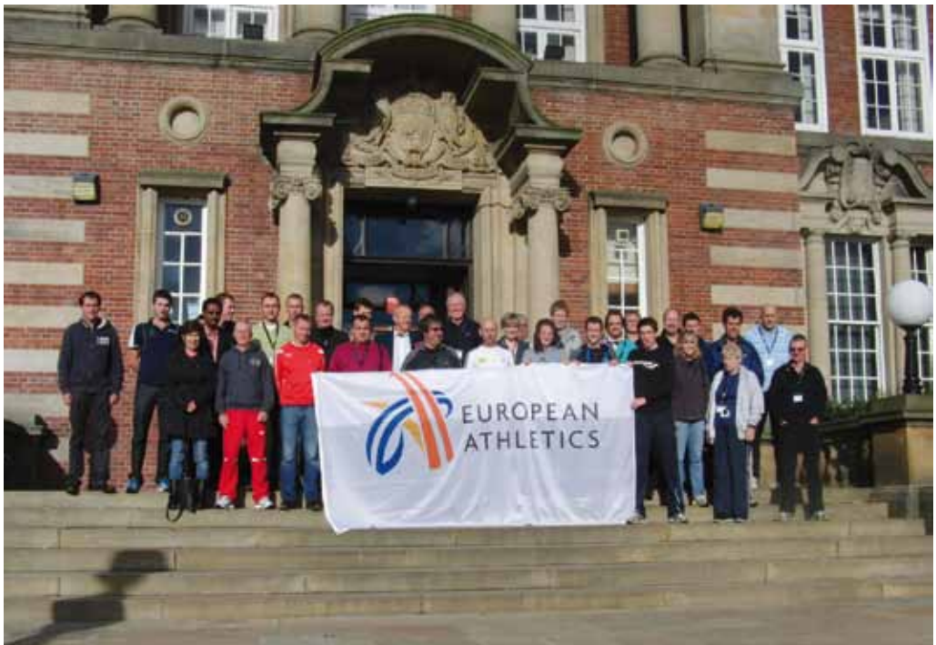
Participants at the 1st European Race Walking Conference