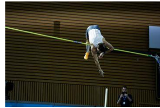
Duplantis breaks world pole vault record with 6.22m in Clermont-Ferrand