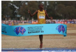
Kiplimo succeeds compatriot Cheptegei as world cross-country champion in Bathurst